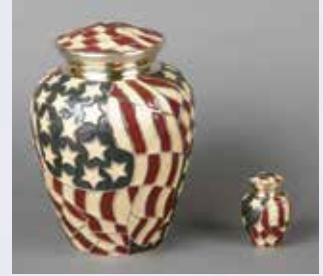
Valley Forge $129