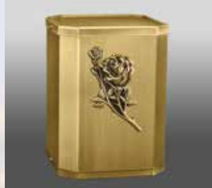
Victory III $212