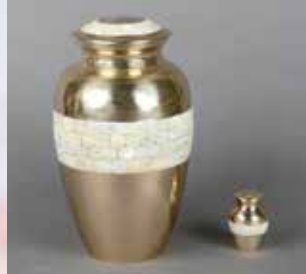
Mother of Pearl $129