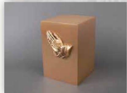
Praying Hands $328

Urn not included - Suggested urn pictured - Choose from our wide selection of available urns