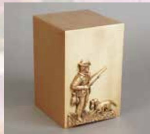
The Hunter $375