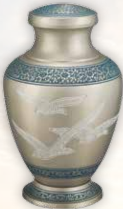
Silver with Doves $135

We offer cremation packages tailored to fit your unique needs and budget.