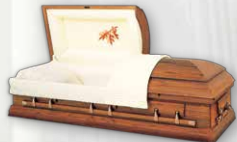
Rental Casket Included