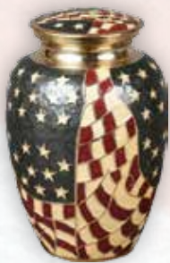
Old Glory $185