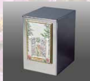
The Way Home $462

Samples pictured - Choose from our wide selection of available urns