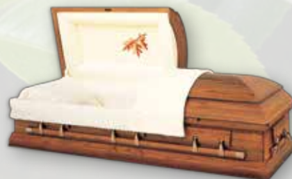
Rental Casket Included