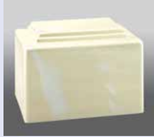
York I $119