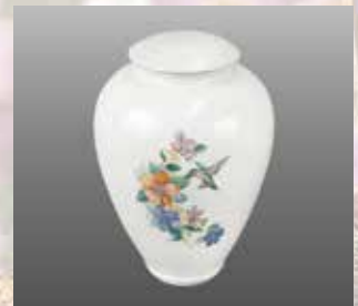
Tivoli II $185