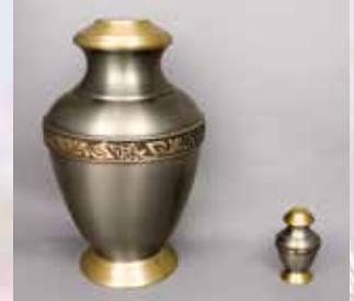
Roman IV $129